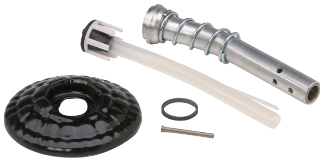
V3 Spout Kit