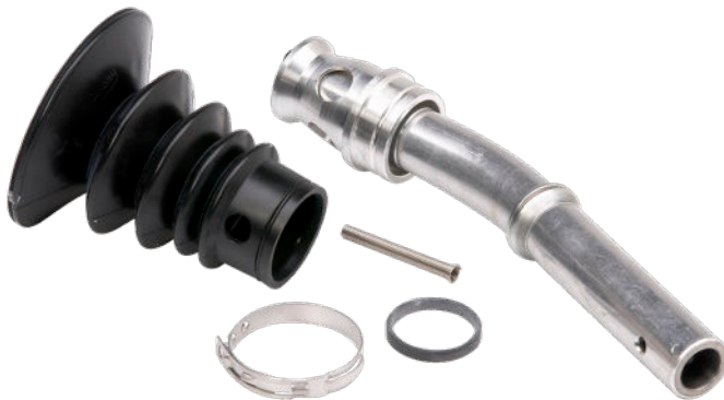
V34 Spout Kit